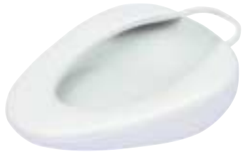
BF-B FRACTURE BEDPAN WHITE P/P WITH HANDLE

P/P = POLYPROPYLENE = AUTOCLAVABLE P/E = POLYETHYLENE