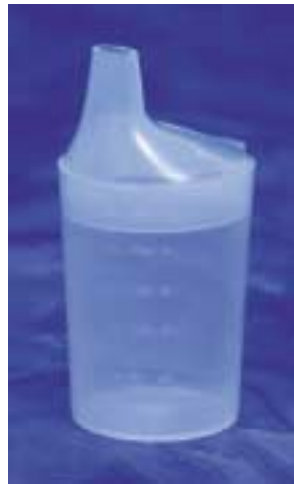
FB-S FEEDING BEAKER P/P WITH SPOUT