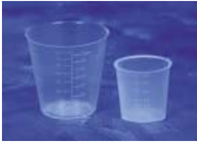
SUGAP 005 SUGAP 010 MEDICINE TUMBLER 75ml / 25ml GRADUATED