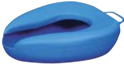
BP-BH BEDPAN PERFECTION BLUE WITH HANDLE