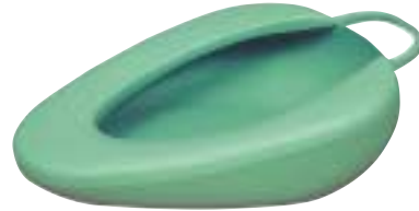
BF-G FRACTURE BEDPAN GREEN P/E WITH HANDLE