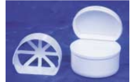
DB-I DENTURE BATH P/P + INSERT