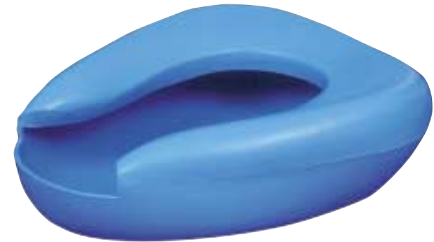
BP-B BEDPAN PERFECTION BLUE P/P