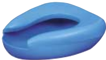
BP-B BEDPAN PERFECTION BLUE