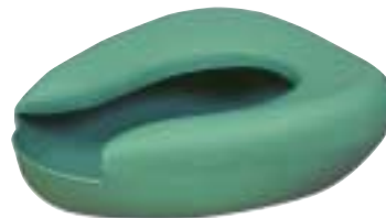
BP-G BEDPAN PERFECTION GREEN