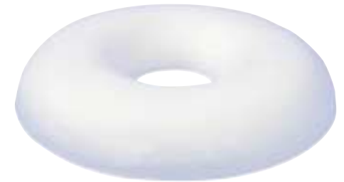
IFC INVALID FOAM CUSHION