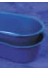
KB-250 KIDNEY BASIN P/P 250ml