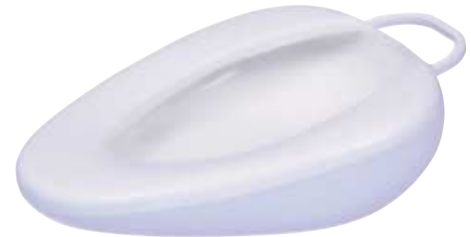
BF-B FRACTURE BEDPAN WHITE P/P WITH HANDLE