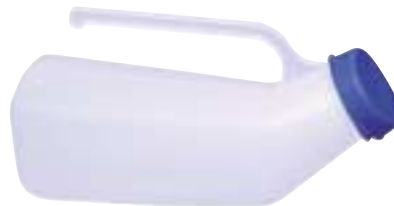
MU MALE URINAL P/E WITH HANDLE