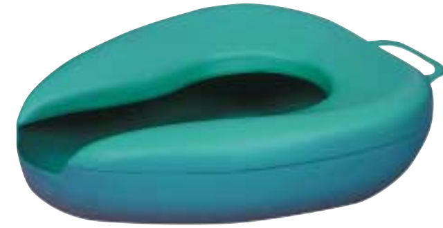
BP-GH BEDPAN PERFECTION GREEN WITH HANDLE