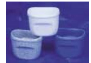
EB EYE BATH RIBBED P/P