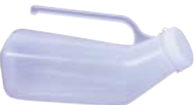
MU-A MALE URINAL P/P WITH HANDLE