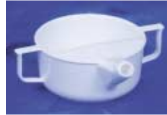
FC-H FEEDING CUP WITH HANDLES P/P