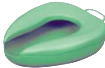
BP-GH BEDPAN PERFECTION GREEN WITH HANDLE