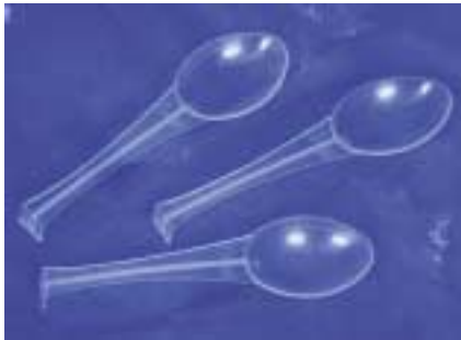
SUMAR 010 MEDICINE SPOON P/P 5ml