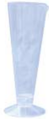
SUVOL 009 URINE SPECIMEN BEAKER POLYETHYLENE WITH SPOUT