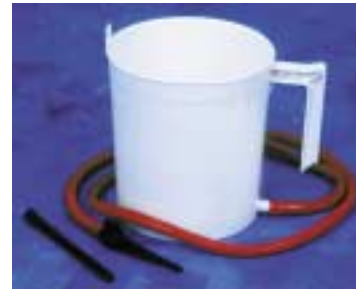
DC-C DOUCHE CAN P/E COMPLETE