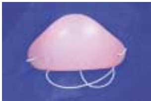
ES EYE SHIELD PINK WITH ELASTIC